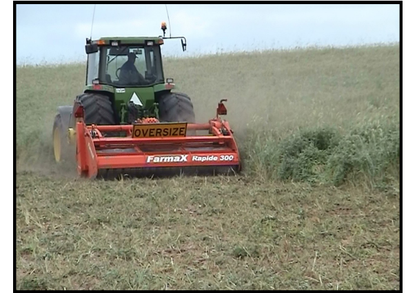
Green Manuring with the Farmax Spader